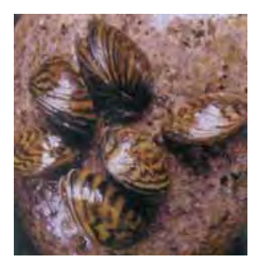
Figure 8. Zebra Mussels ( Dreissena polymorpha )

Zebra mussel information needs to be disseminated more widely, particularly to Non Governmental Organisations. A code of practice to encourage appropriate behaviour should be developed, because some organisations do not inspect their boats, even after receiving the ZMCG information on zebra mussels. Finally employees involved in work on fresh water bodies need to be informed how to minimise the risk of transferring zebra mussels to uncolonised waters. For example a simple checklist, listing steps to be taken to prevent mussel spread, could be distributed by organisations to relevant employees. This could be made available for download from the zebra mussel website (Action 1.5 and Action 3.3).