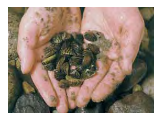
Figure 2. Zebra mussel (Dreissena polymorpha)

Dreissena polymorpha was first described by the Russian zoologist Pallas in 1771 and is commonly known as the zebra mussel due to the striped appearance of its shell, the pattern can be variable as indicated by the name 'polymorpha' or 'many forms'.