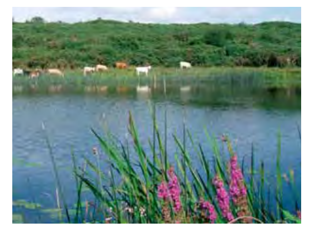
Figure 5. Upper Lough Erne

Numerous strategies exist for the control of zebra mussels in industrial systems. Control strategies can be divided into two main categories, chemical and non-chemical. Chemical controls are the most popular and widely used methods of zebra mussel control. Chemical methods include the use of chlorine, ozone, bromine, potassium permanganate, molluscicides, flocculation processes, salinity, oxygen deprivation and antifouling coatings.