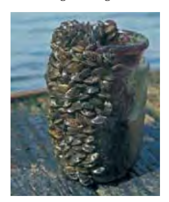
Figure 3. Zebra mussels covering a pot

The most significant economic losses as a result of zebra mussel fouling have occurred in North America. Numerous municipal and industrial facilities have experienced severe zebra mussel fouling. Facilities that have been severely affected include Ontario Hydro station facility, Detroit Edison facility, Perry Nuclear power plant and Monroe waterworks, Michigan (Harrington et al., 1997). At Monroe waterworks zebra mussel fouling reduced water flow by 20% and the cost of controlling the infestation from 1989 to 1991 was $300,950 (LePage, 1993). The US Fish and Wildlife Service (1999) estimated that large water users in the Great Lakes, including municipalities and industry, pay at least $30 million a year to prevent zebra mussels infesting water intake pipes and causing blockages of water flow.