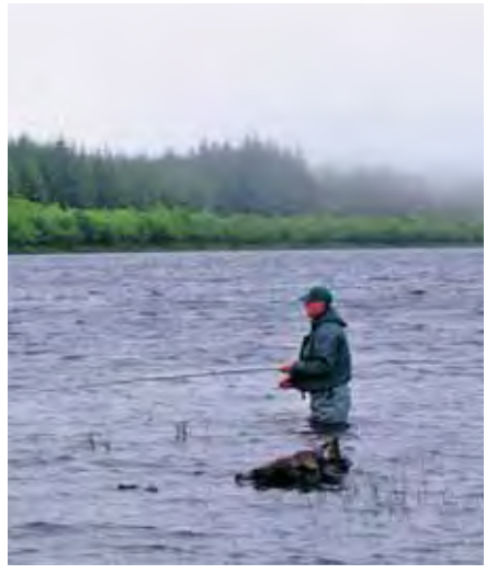
Figure 7. Angler at Lough Navar