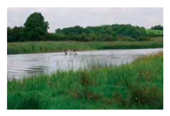
Figure 9. Monitoring on Lough Beg

There is no definitive method for prioritising lakes and the method used is constrained by the availability of data. Adopting the most stringent criteria published in the literature ensured that all lakes suitable for zebra mussel invasion were included in the vulnerable lakes list, although this increased the number of lakes in the list. Not all lakes in Northern Ireland were surveyed in the Northern Ireland Lakes Survey (NILS) therefore there may be suitable lakes which were not included in the analysis. However this method provides a straightforward template which will allow assessment of additional lakes as data becomes available