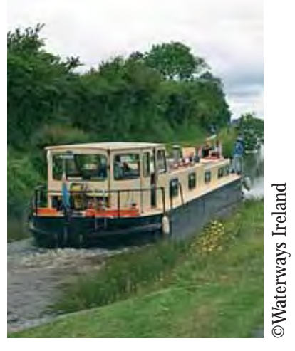
Figure 6. Barge on Barrow navigation

In summer conditions in North America, zebra mussels can survive for more than five days attached to a boat hull or trailer (Ricciardi et al. , 1995). In Ireland, zebra mussels will be likely to survive for longer periods because of the lower temperatures. Larval stages of zebra mussels can survive at least 8 days in water collected from live wells in recreational fishing boats (Johnson & Padilla, 1996). Zebra mussels will survive transport between waterbodies in Ireland.