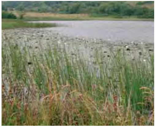
Figure 12. Lough na Blaney Bane

Surveillance is the act of undertaking repeated surveys and monitoring is surveying against a standard to determine subsequent changes (DEFRA, 2003). To successfully manage the impacts of further zebra mussel invasions in the prioritised lakes, it is necessary to draw up a structured surveillance programme.