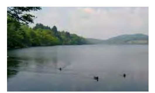
Figure 1. Castlewellan Lake

Research into the zebra mussel invasion and subsequent impacts has been carried out in both jurisdictions with good information sharing and networking between researchers. In Northern Ireland, research has been funded by Environment and Heritage Service (EHS), the Department of Agriculture and Rural Development (DARD) and the Department of Culture, Arts and Leisure (DCAL). Since 1998, this has included investigations into the invading population dynamics of the zebra mussel; vectors; documenting spread; effects on aquatic food webs and native species and development of strategies to limit the spread of zebra mussels in Northern Ireland (Rosell et al., 1999; Maguire, 2002; Minchin, 2003;