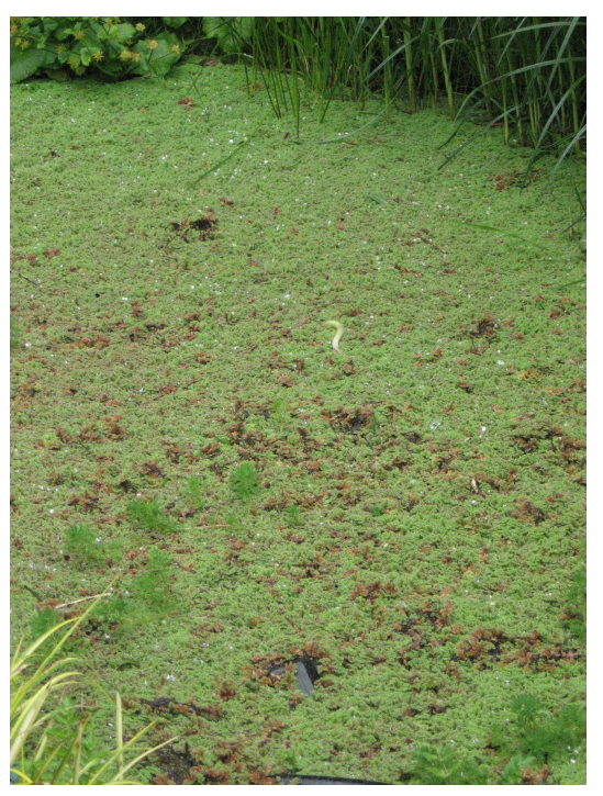
Forms dense mats but can also be present as a few fronds amongst emergent or other floating vegetation