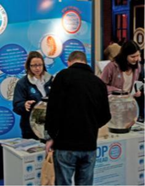
The Green Blue and NNSS promoting Check, Clean, Dry at the Dinghy Show, Alexandra Palace