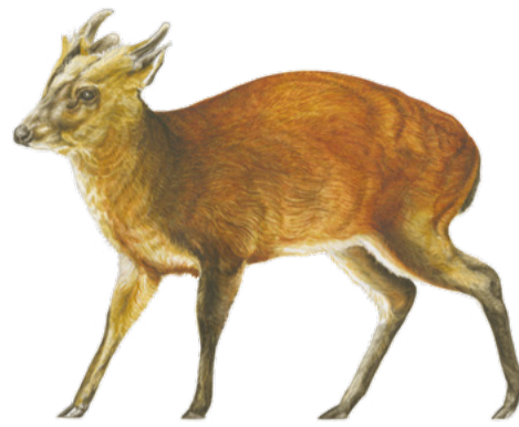
Muntjac deer Muntiacus reevesi