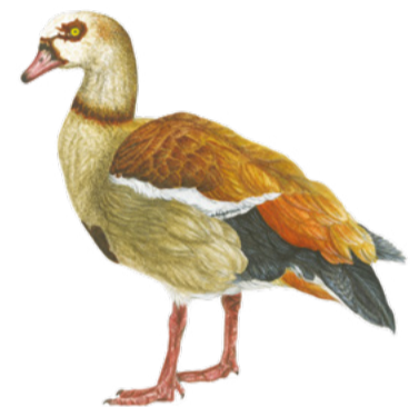
Egyptian goose Alopochen aegyptiacus