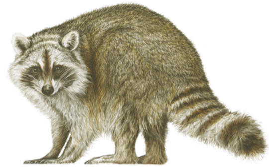
Raccoon Procyon lotor