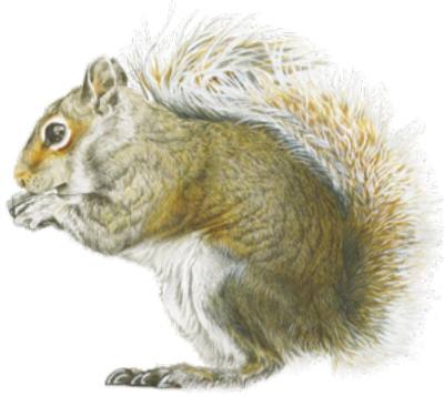
Grey squirrel Sciurus carolinensis