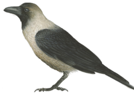
Indian house crow Corvus splendens