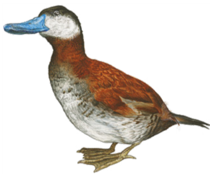
Ruddy duck Oxyura jamaicensis