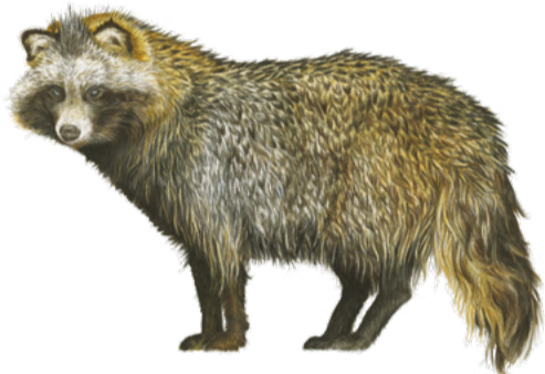
Raccoon dog Nyctereutes procyonoides