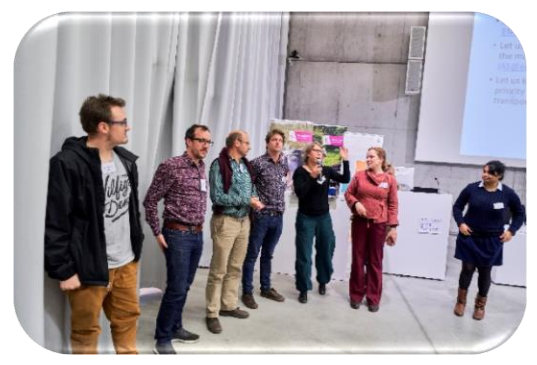
An interactive discussion with some of the speakers.

perhaps to help form new networks and collaborations for the future.