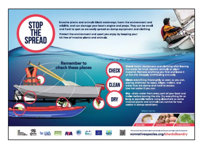
An example of the style of signage (also available in poster format) avavilable for installation. This is the freshwater boating version

In parallel with the biosecurity workshops, we are installing Check Clean Dry signage across England and identifying distribution points where we can provide INNS and biosecurity awareness-raising materials. These distribution points can be anywhere from local chandleries, to visitor centres at large waterbodies. The materials are specific to different user groups, such as boaters, anglers, canal boat etc. If you think that you know an area in your region that would benefit