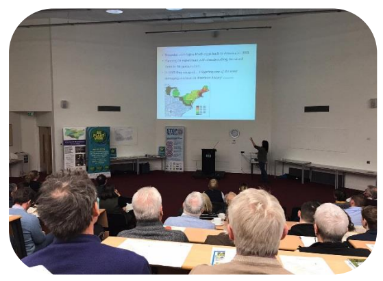
Andrea Griffiths delivering a presentation at a biocontrol workshop in the South East region.

As you may know, in the last few months, through various sub-contractors, RAPID LIFE has been delivering a series of workshops to engage people in training as well as awareness-raising. There have been biosecurity training workshops targeted at water asset managers in high risk areas. The aim is that these training workshops will encourage water asset managers to write biosecurity plans for their site and embed biosecurity and invasive species management into their organisation.