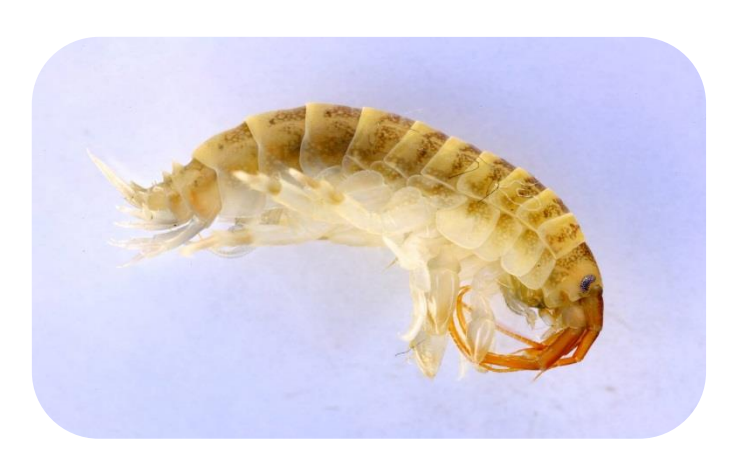
Killer shrimps ( Dikerogammarus villosus and Dikerogammarus haemobaphes) both found in Britain and are national alert species.