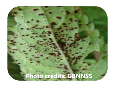
Himalayan Balsam Impatiens glandulifera infected with rust fungus Puccinia komarovii

The project will also demonstrate the use of a novel method to manage IAS – biological control. This offers sustainable, long-term management of IAS in the target environments.