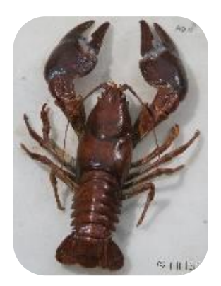
N. American Signal Crayfish Pacifastacus leniusculus