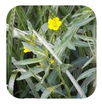
Water Primrose Ludwigia grandiflora