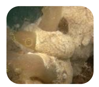
Carpet Sea Squirt Didemnum vexillum