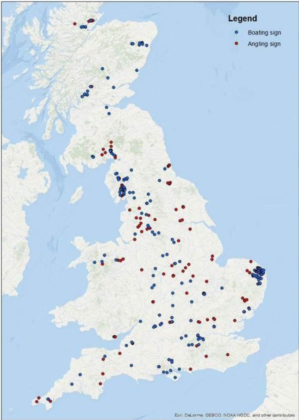
Figure 1. Map of distribution of Check Clean Dry fixed signs (some locations missing).