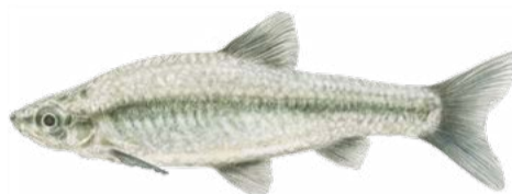
Topmouth gudgeon Pseudorasbora parva