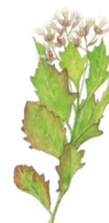
Sea myrtle Baccharis halimifolia