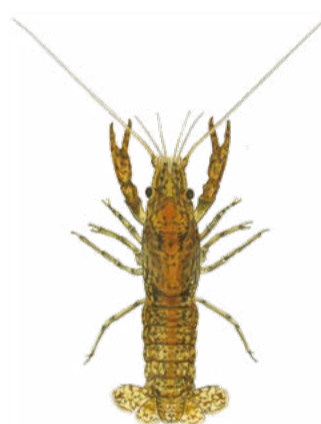
Marbled crayfish Procambarus fallax f. virginalis