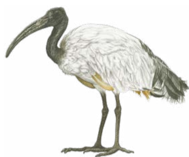
Sacred ibis Threskiornis aethiopicus