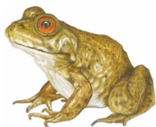
American bullfrog Lithobates catesbeianus