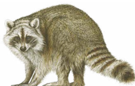
Raccoon Procyon lotor