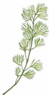
Carolina fanwort Cabomba caroliniana