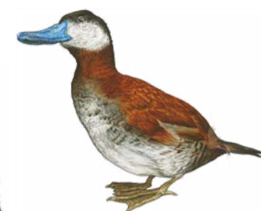
Ruddy duck Oxyura jamaicensis