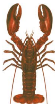
American lobster Homarus americanus