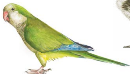
Monk parakeet Myiopsitta monachus