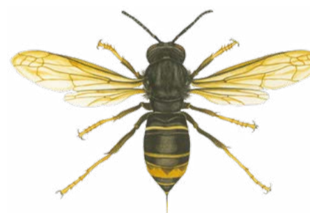
Asian hornet Vespa velutina