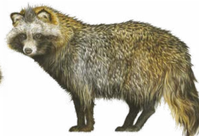
Raccoon dog Nyctereutes procyonoides