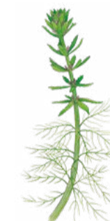
Various-leaved watermilfoil Myriophyllum heterophyllum