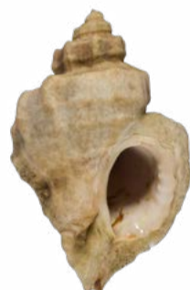
Japanese sting winkle Ocenebrellus inornatus