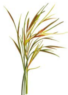
Chilean needle-grass Nassella neesiana