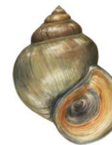
Chinese mystery snail Cipangopaludina chinensis