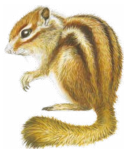
Siberian chipmunk Tamias sibiricus