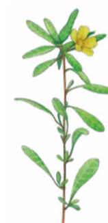
Water primrose Ludwigia grandiflora