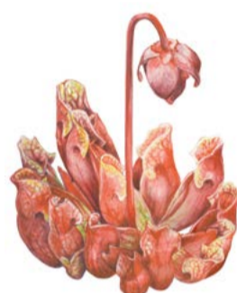
Purple pitcher plant Sarracenia purpurea