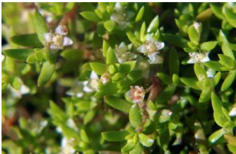
New Zealand pygmyweed