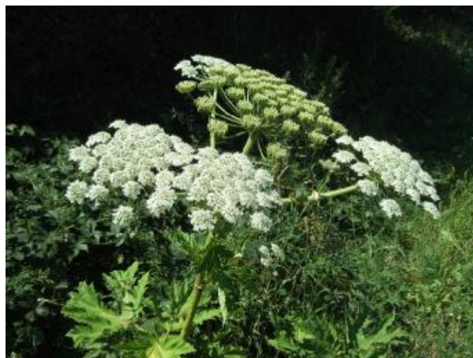
Giant hogweed along the Avon Water in 2009 prior to start of the herbicide treatment

The Project Officer now needs to secure the remaining £1,513.25 from landowners to enable two herbicide treatments to be undertaken in 2015.