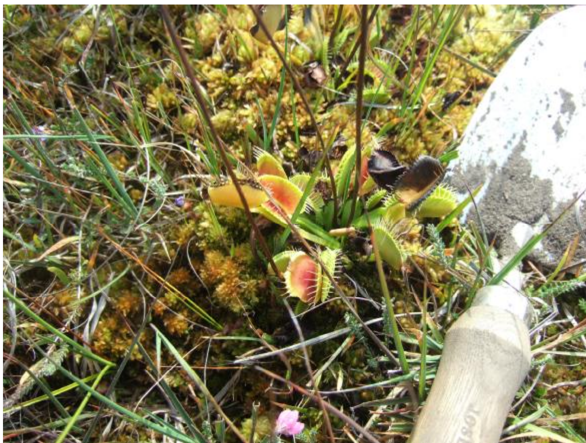
Venus Fly Trap – refer to page 14 for details