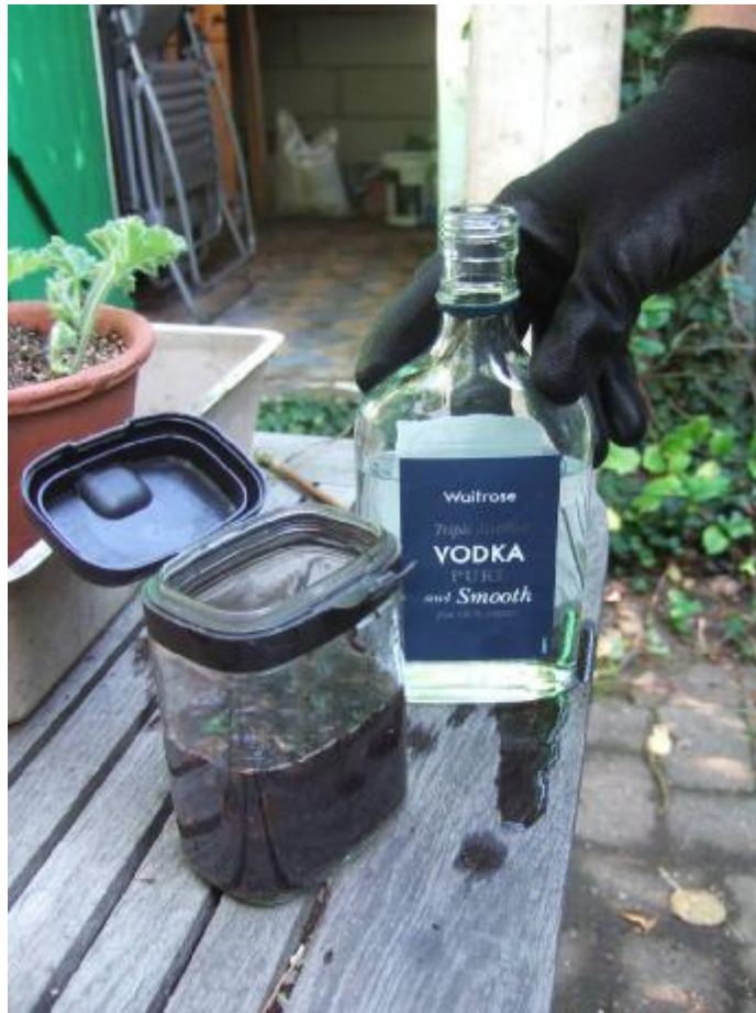
The dead invertebrates (many of which are Sexton beetles) were collected from the 'pitchers', preserved in alcohol in an old coffee jar and delivered to entomologist Paul Brock on 2 October for expert identification.