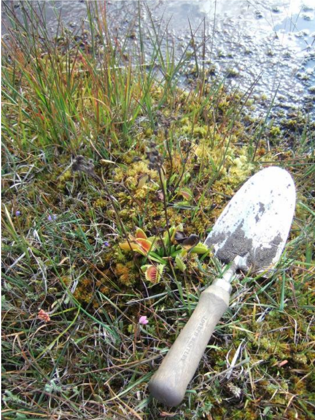
Venus Fly Trap plants were dug up from a bog near Burley at SU 19292 03892 on 30 September 2014

During August 2014 the Project Officer had been alerted to a population of Venus Fly Trap Dionaea muscipula which had been planted in a bog near Burley. Consent was obtained from Natural England in accordance with the Wildlife and Countryside Act 1981 for it to be dug up and the plants were removed on 30 September 2014.