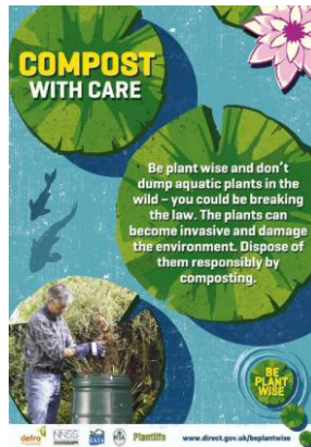
Logo Example 1