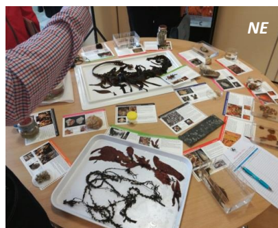
Providing samples promotes awareness and prompts

The plans, with a wider geographical scope and wider stakeholder buy-in, clearly had the potential to be successful but they also required more time to create and will require co-ordination to ensure that they continue to achieve their potential positive impact. Smaller site plans are, by their nature, more contained but are limited in what they can achieve if they are not networked into wider regional plans.