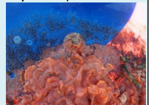
Jirina Stehlikova, SAMS

Schizoporella japonica (Orange ripple bryozoan)