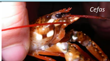
Hybrid American/European lobster hatched from an egg bearing female American lobster landed in Bergen, Norway.

American lobsters ( Homarus americanus ), are endemic to the east coast of North America, from Labrador to North Carolina. There is an extensive fishery for the lobster throughout this area, and much of the catch is exported live to Europe, including the UK. From the early 1980s American lobsters have been found in UK waters in limited numbers. There are concerns that the species could pose a potential risk to native species, such as the European lobster ( Homarus gammarus ),