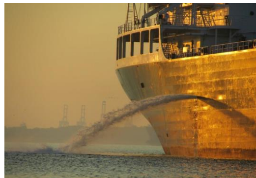
Vessel discharging ballast

Ballast water is used to stabilise vessels whilst at sea. It has since been recognised that the exchange and transfer of ballast water between ports and other locations represents an important pathway for the introduction of aquatic non-native species and thereby poses a considerable risk to vulnerable habitats and aquatic biodiversity. Following the UN Conference on Environment and Development, held in Rio de Janeiro in 1992, the International Maritime Organization's (IMO) Ballast Water Working Group began the process of drafting a global agreement designed to address the role of shipping in the transfer and spread of such organisms. The result was the International Convention for the Control and