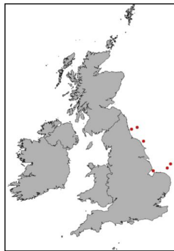
The locations where M. leidyi has been detected.

A rapid risk assessment for this species is currently being undertaken. Further reports of this species will be monitored and its distribution traced. Good biosecurity and pathway management in UK waters, as measures to reduce the risk of introduction and spread of NIS, continue to be promoted and implemented.