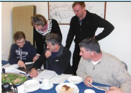
Burnham – Group discussion leading to practical biosecurity planning.