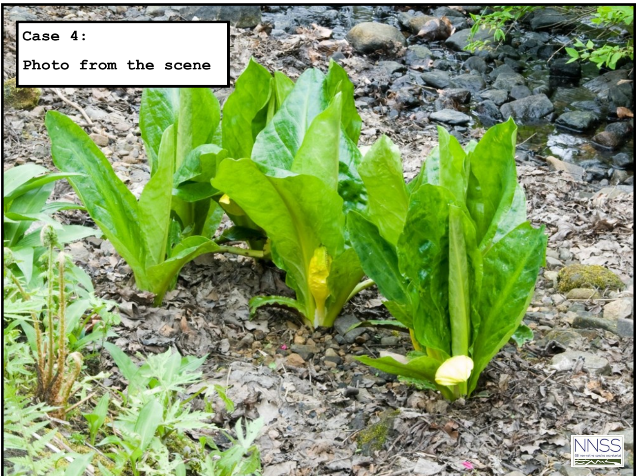
Photo from the scene