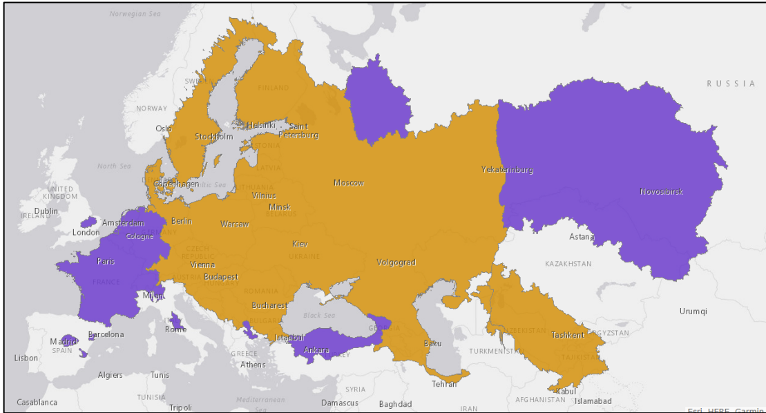
Figure 1. Distribution map of S. luciopera (Freyhof & Kottelat, 2008, 2018). Mustard denotes native populations, purple is introduced populations.

Many of the Western European countries in which S. luciopera has successfully established populations are climatically matched to that of the UK, including countries such as France, the Netherlands and Belgium (Gallardo & Aldridge, 2013).