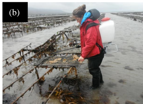
Oyster bags fouled with D. vexillum being treated by (a) bag turning and (b) spraying bags with a 5% vinegar solution.

Invasive species are a known threat to biodiversity and to the operation of aquaculture businesses. Any initiative to manage invasive species will ultimately facilitate the continued operation and growth of the aquaculture sector.