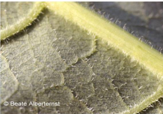
Fig. 5. Trichomes, F. sachalinensis