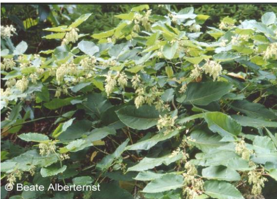
© Beate Alberternst Fig. 3. F. sachalinensis , ♀