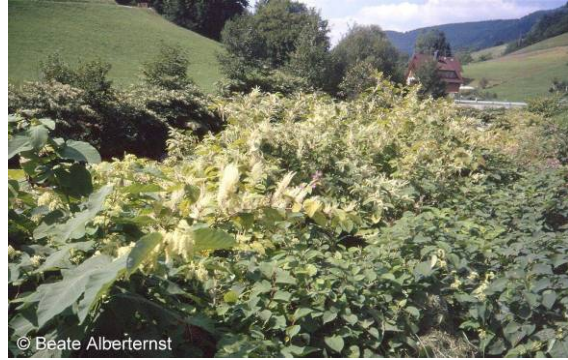
Fig. 2. F. japonica , F. sachalinensis and F. x bohemica , Wolfach, Black forest, Germany (1993)