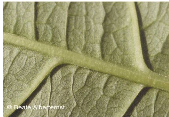
Fig. 6. Trichomes, F. japonica