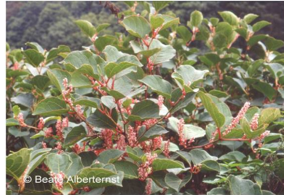
© Beate Alberternst Fig. 8. F. japonica var. compacta , Gernsbach, Germany