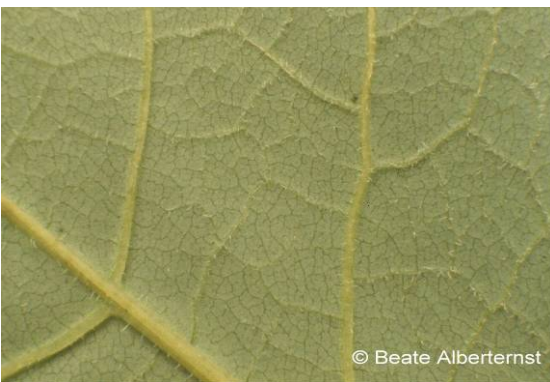
© Beate Alberternst Fig. 7. Trichomes, F. x bohemica