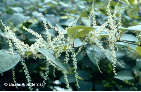
© Beate Alberternst Fig. 1. F. japonica , ♀