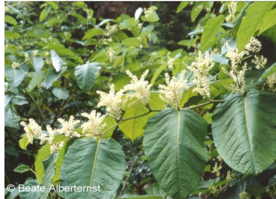
Fig. 4. F. sachalinensis , ♂