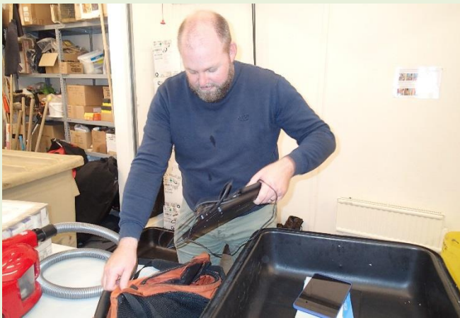
Biosecurity checks on arrival in South Georgia

In 2016 Defra and the NNSS secured funding over four years (2016-2020) under the FCO's Conflict, Stability and Security Fund to help the development of comprehensive biosecurity for the OTs by providing them with access to UK expertise on risk analysis, pathway management, pest identification, horizon scanning, contingency planning, rapid response capability and species management. The project, Tackling Invasive Non-Native Species in the UK Overseas Territories , is part of the UK Governments response to the Honolulu Challenge, announced by the IUCN in 2016, calling for greater action to tackle the issue of invasive non-native species across the globe with particular attention to preventative action and the development of effective biosecurity policies. The project is managed by the NNSS.