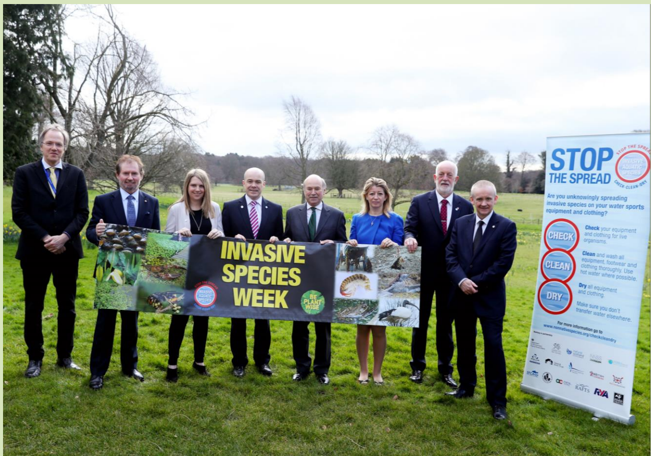
Ministers announced a joint approach to biosecurity across England, Guernsey, the Isle of Man, Jersey, Northern Ireland, the Republic of Ireland, Scotland, and Wales at the British Irish Council meeting on 23 rd March 2018.

The joint approach to biosecurity was announced by Ministers at the British Irish Council meeting in Dublin on 23 March 2018. To further enhance cooperation, Ministers from Ireland and the UK agreed to pursue a proposal to include a number of Ponto-Caspian species on an EU Regional List under the IAS Regulation, and to strive to bring in countries on the near continent to reduce the risk of invasion of these species.