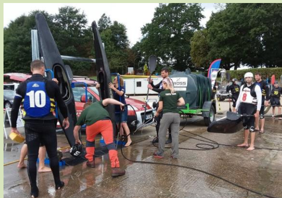
A wash-down station at a large canoeing event.

The NNSS also commissioned LAGs to develop biosecurity protocol for angling and canoeing events from which a training package will be developed and deployed (delayed due to COVID-19, now expected in autumn 2020).