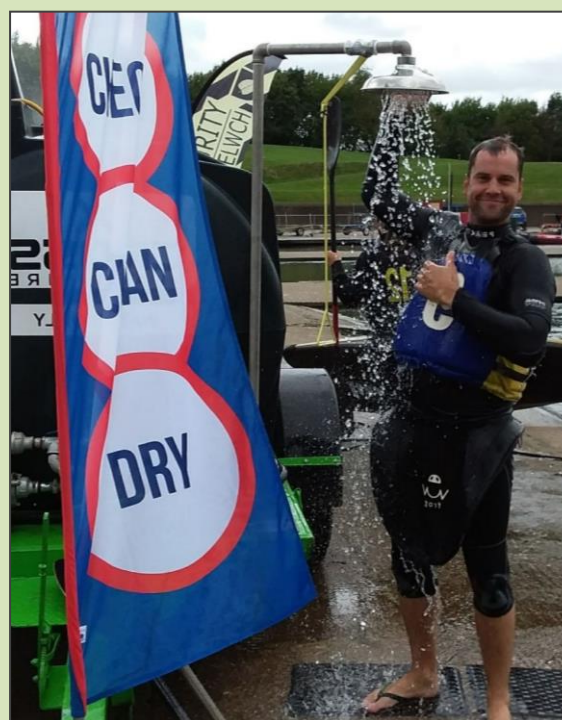
Participants were asked to arrive with clean clothing and equipment, and to wash this before leaving, to prevent the spread of invasive aquatic species.