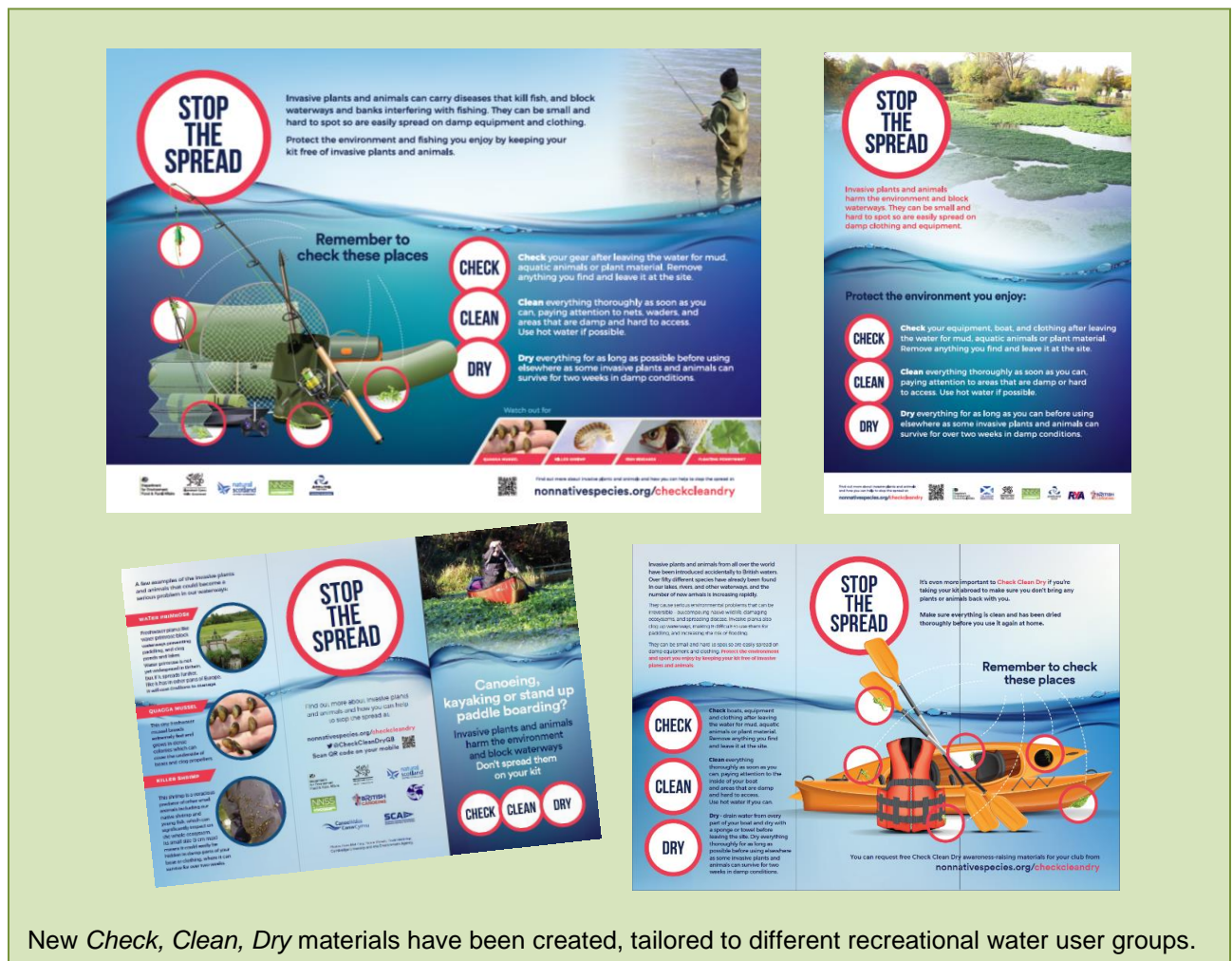
New Check, Clean, Dry materials have been created, tailored to different recreational water user groups.