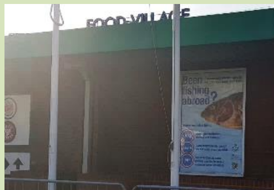
Posters have been displayed in key locations at ports in England with links to mainland Europe.

The campaign was expanded to run for six months, from March – September 2018. The materials were updated and new materials developed for canoeists / kayakers. Due to procurement delays and no suitable contractor being found to run the campaign, the NNSS contacted ports directly to procure advertising space. Four ferry ports linking to France and Holland (Dover, Portsmouth, Newcastle and Plymouth) were selected as they accounted for 82% of all incoming passenger vehicle traffic entering the UK from mainland Europe by ferry. Advertisements were also commissioned in EasyJet magazine, as a result of the findings of the survey of stakeholder and public awareness - that anglers are