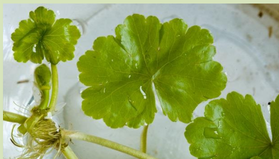
Many can spread from a tiny fragment and survive out of water on damp clothing and equipment for over two weeks.