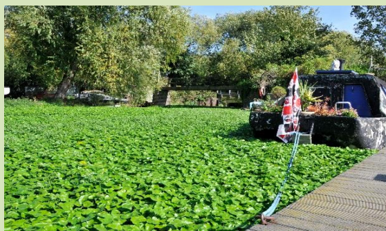
Invasive aquatic species such as floating pennywort (pictured) are particularly invasive.

In 2017, a partnership was formed with the aim of improving aquatic biosecurity and mitigating the significant threat to water companies posed by invasive non-native species (INNS). Eight water companies generously invested £450k to support a three year enhanced Check, Clean, Dry work programme (see Annexes A-B for details of contributions and spend). This was led by the GB Non-native Species Secretariat (NNSS), overseen by a steering group of water companies and key Check, Clean, Dry partners.