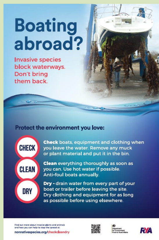
Materials are tailored to different recreational user groups to increase engagement.